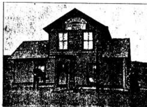
Corbin Hotel Glencoe, N D